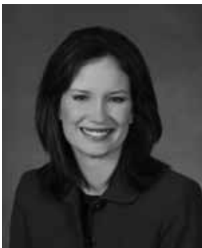
BROOKE L. ROLLINS President & CEO

Called “the Margaret Thatcher of financial regulation” by The Wall Street Journal , the Texas Public Policy Foundation’s Chairman founded the Regulatory Studies Program at the Mercatus Center at George Mason University, where she is a Distinguished Senior Scholar. Gramm served as chairman of the U.S. Commodity Futures Trading Commission from 1988-1993. She was Administrator for Information and Regulatory Affairs at the Office of Management and Budget from 1985-1988, the executive director of the Presidential Task Force on Regulatory Relief, and director of the Federal Trade Commission’s Bureau of Economics. Gramm has been on the research staff of the Institute for Defense Analysis. She started her economics career at Texas A&M University, where she taught economics for over eight years. She holds a B.A. from Wellesley College and a Ph.D. from Northwestern University, both in Economics.