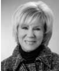
THE HONORABLE FLORENCE SHAPIRO

While there are many Texas charter schools producing great results with high percentages of graduates attending college and thousands of students on waiting lists, there are still some policy barriers to expansion. Where do we go from here? What policies would help high-performing charter schools expand and flourish?