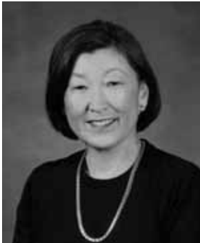
DR. WENDY L. GRAMM Chairman

Called “the Margaret Thatcher of financial regulation” by The Wall Street Journal , the Texas Public Policy Foundation’s Chairman founded the Regulatory Studies Program at the Mercatus Center at George Mason University, where she is a Distinguished Senior Scholar. Gramm served as chairman of the U.S. Commodity Futures Trading Commission from 1988-1993. She was Administrator for Information and Regulatory Affairs at the Office of Management and Budget from 1985-1988, the executive director of the Presidential Task Force on Regulatory Relief, and director of the Federal Trade Commission’s Bureau of Economics. Gramm has been on the research staff of the Institute for Defense Analysis. She started her economics career at Texas A&M University, where she taught economics for over eight years. She holds a B.A. from Wellesley College and a Ph.D. from Northwestern University, both in Economics.