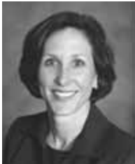
THE HONORABLE LOIS KOLKHORST

President Obama's version of health care reform has almost made its way through the U.S. Congress, and though not final, it is very possible that many of his reform ideas will ultimately become law. This panel will discuss the remaining issues Congress must still work out before health care legislation is passed, the reform's potential fiscal impact, and the changes patients can expect to see in the years to come.