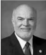
THE HONORABLE ROBERT NICHOLS

Will relying on the gas tax free Texans from traffic congestion? During a time when voter opposition to the growth of government is increasing, congestion also increases, and there remain calls to raise taxes to build more roads and rail. This panel will look at the growth of government spending, the lack or prioritizing transportation, and options available to address the problem.