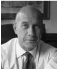
THE HONORABLE JOHN WHITMIRE

While reforms over the last few years have reduced the number of adults and juveniles incarcerated in Texas, the state still has the nation's second highest adult incarceration rate and more than 6,000 youths are in state or local lockups on any given day. As state lawmakers brace for significant budget pressures in the new biennium, this panel will address how Texas can build on the recent reforms in the adult and juvenile systems to achieve the goals of controlling costs and reducing recidivism.