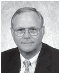
THE HONORABLE JIM MCREYNOLDS

Senator John Whitmire represents the 15th Senatorial District comprised of north Houston and north Harris County. He was elected to the Texas Senate in 1982 after serving 10 years in the Texas House of Representatives. With over 26 years of service in the Texas Senate, Senator Whitmire ranks first in seniority and is the "Dean of the Texas Senate." Currently, he serves as Chair of the Senate Criminal Justice Committee and works to bring about needed changes to the adult and juvenile criminal justice systems. Senator Whitmire also serves as Chair of the Criminal Justice Legislative Oversight Committee.